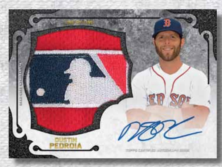
Primary Pieces Autograph Relic Card - Supreme Parallel