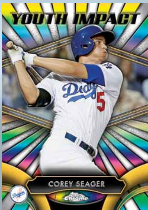
Youth Impact Insert Card