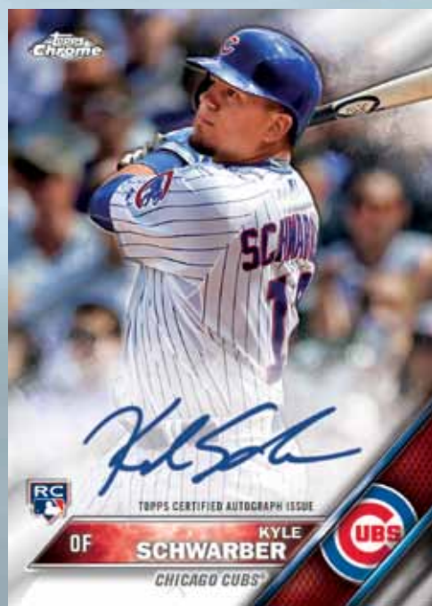
Rookie Autograph Card