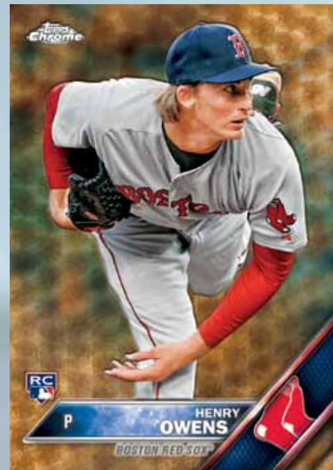
Base Card - Superfractor Parallel

2016 TOPPS CHROME BASEBALL IN STORES AUGUST 2016!