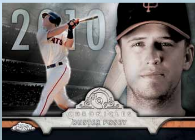
ROY Chronicles Insert Card