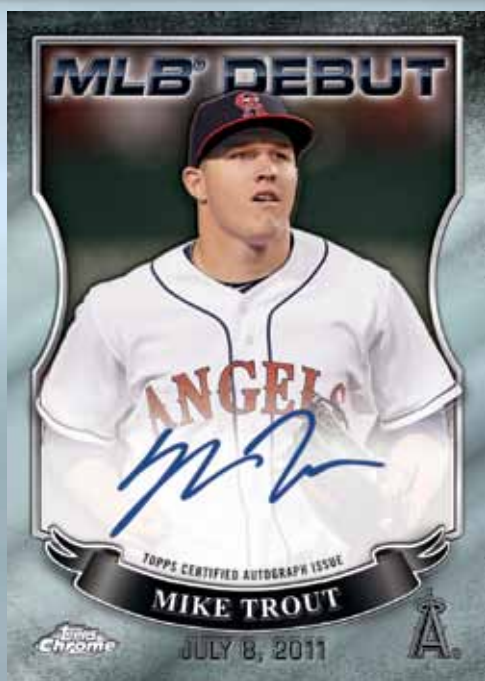
MLB® Debut Autograph Card