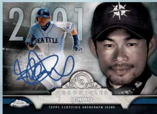
ROY Chronicles Autograph Card

New to the 2016 release, Hobby Jumbo cases will feature 1 ROY Chronicles insert card per case. This limited edition insert set will feature active veterans who have won Rookie of the Year awards.