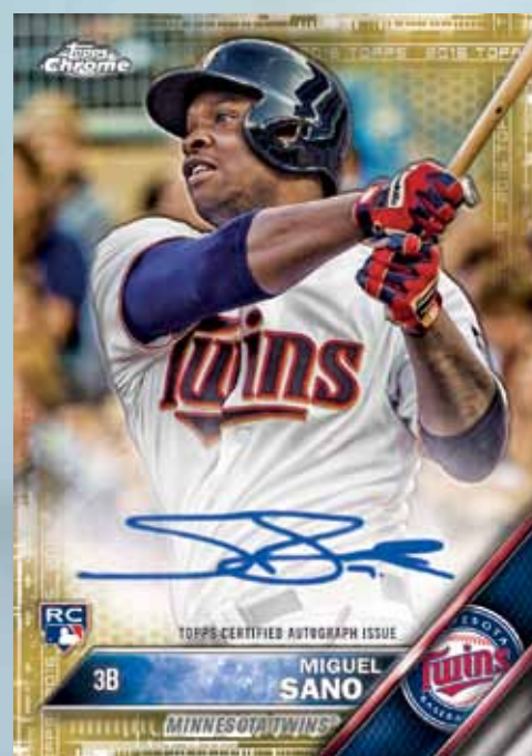
Rookie Autograph Card - Gold Refractor Parallel

The Topps Chrome autographed rookie card is often viewed as the most sought-after rookie card in the industry. Along with its base chrome version, 2016 will also feature the following parallels: