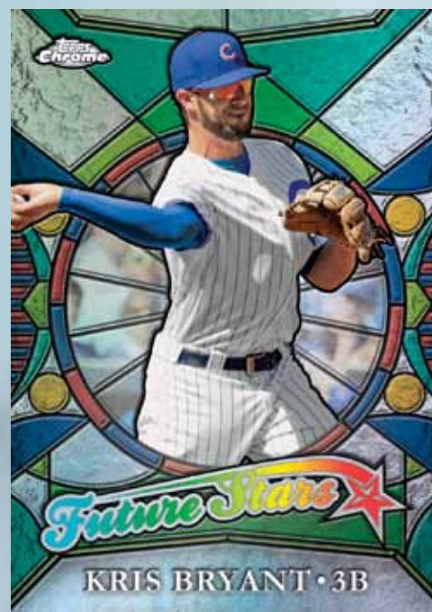
Future Stars Insert Card

2016 Topps Chrome Baseball will be full of collectible insert subsets featuring the most promising young stars of Major League Baseball®.