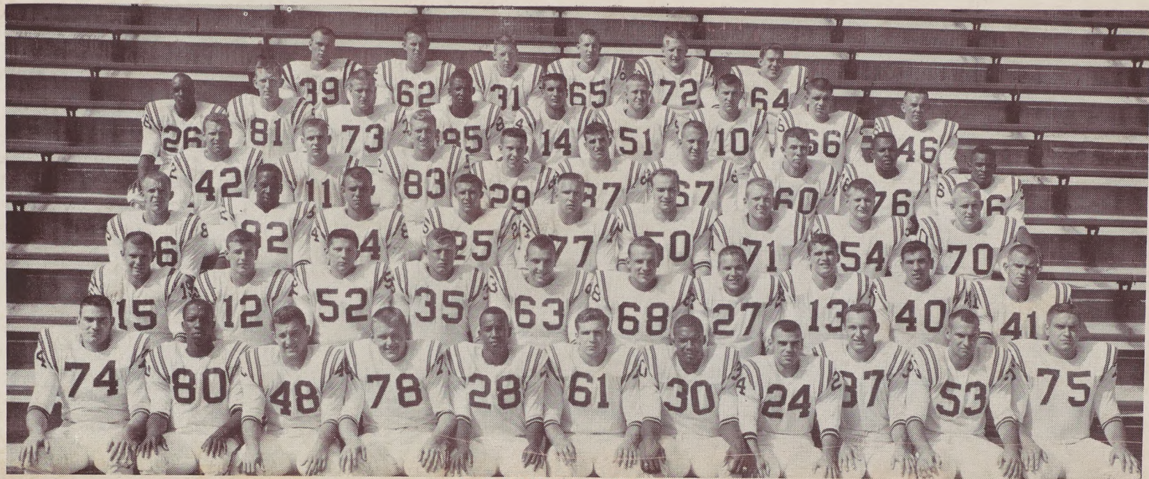
— 1960 BGSU Football Squad —